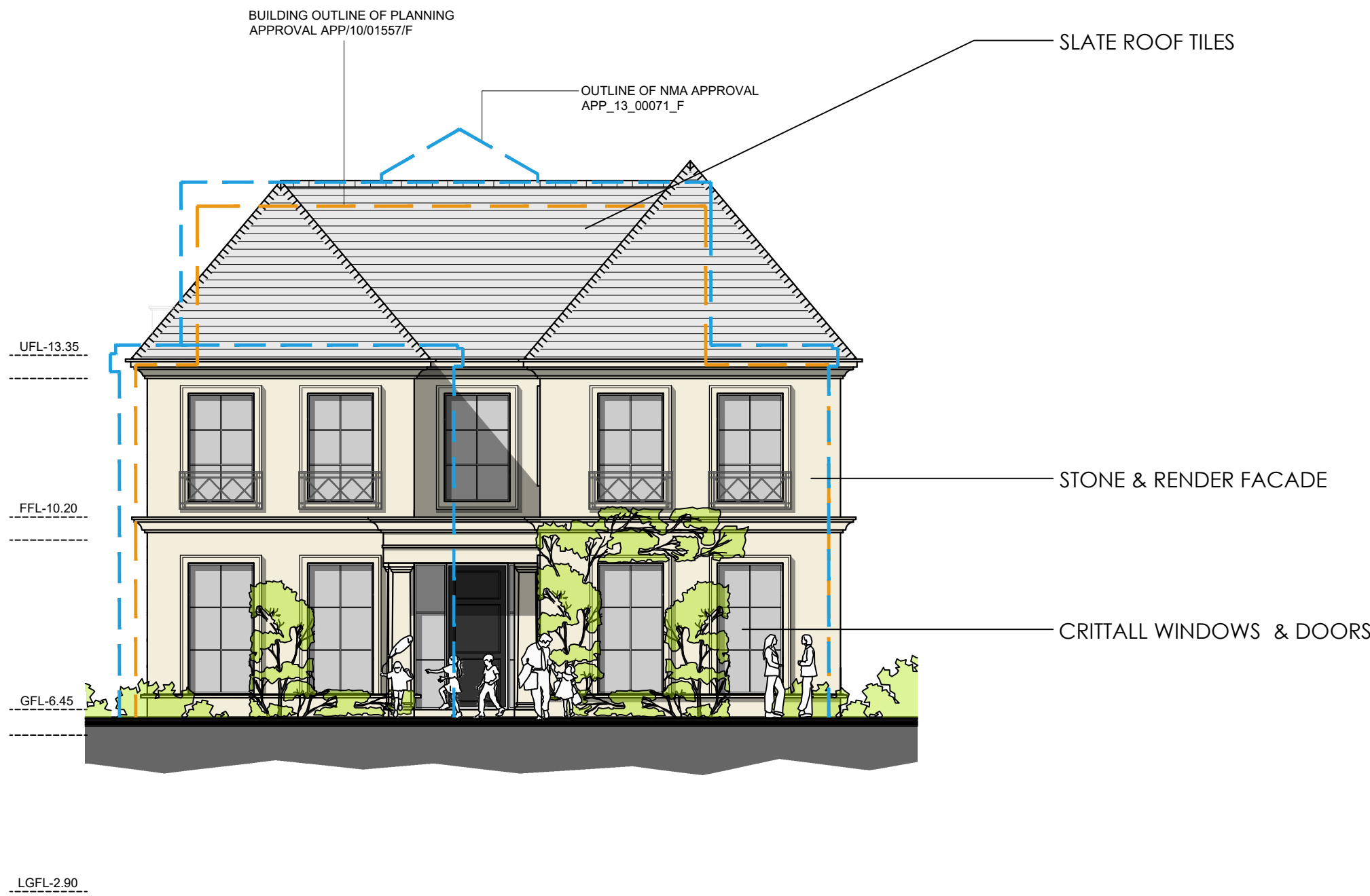
FRONT NORTH EAST ELEVATION SCALE: 1:100 @ A1